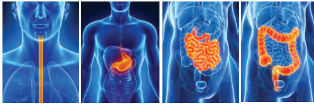
Esophagus Stomach Small Intestine Large Intestine