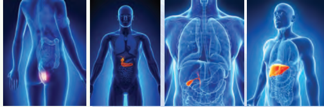
Rectum Pancreas Gallbladder Liver

Also known as the Digestive Tract, the GI Tract is a system of organs designed to digest food.